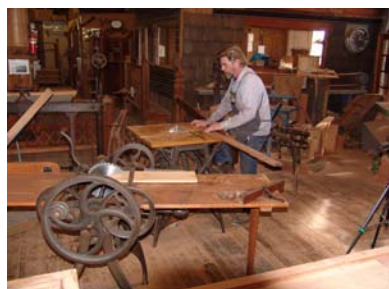
Paul Bunyan greets visitors (left), while Eric demonstrates treadle powered table saw (above).

Guests are greeted by a 15-foot carved and painted statue of Paul Bunyan located next to the main entrance. Once inside, visitors are first presented with a display area containing a treasure of 19 th century human powered woodworking machines. The collection included numerous scroll saws, drill presses, table saws and shapers all powered by treadles or bicycle-like pedals. The picture above shows Eric operating a treadle powered table saw.