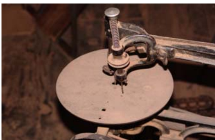
Unique scroll saw that was restored and is in use at Blue Ox Millworks.

The collection also includes a large shear used to cut spade shaped points on the top of fence pickets with a single motion of a 5-foot arm. I was particularly impressed with the scroll saws; each was equipped with a drill head immediately adjacent to the scroll blade (see photo)..